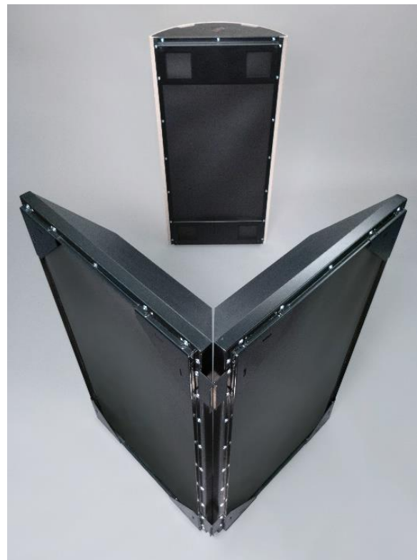
Photo: Membrane views of the Curve Diffusor (top) and two CornerSorbers (corner configuration, bottom)

The dimensional equivalents for room-mode frequency (wavelength) absorption ranges for each product are (approx.): 5.5 to 14 feet (200-80Hz) for CornerSorbers, and 14-25 feet (80-45Hz) for Curve Diffusors.